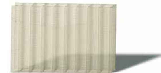
Sample 2: ΔYi = 2: LEXAN THERMOCLEAR sheet warranty