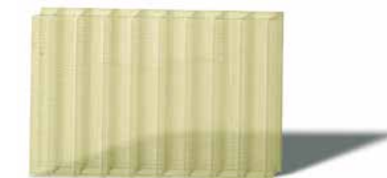
Sample 3: ΔYi = 10: Typical polycarbonate multiwall sheet warranty