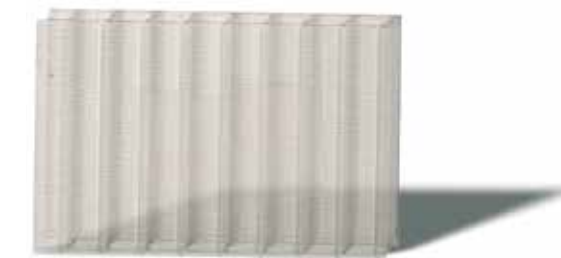
Sample 1: ΔYi = 0

Please consult your local distributor or SABIC's Innovative Plastics Sales Office for more details.